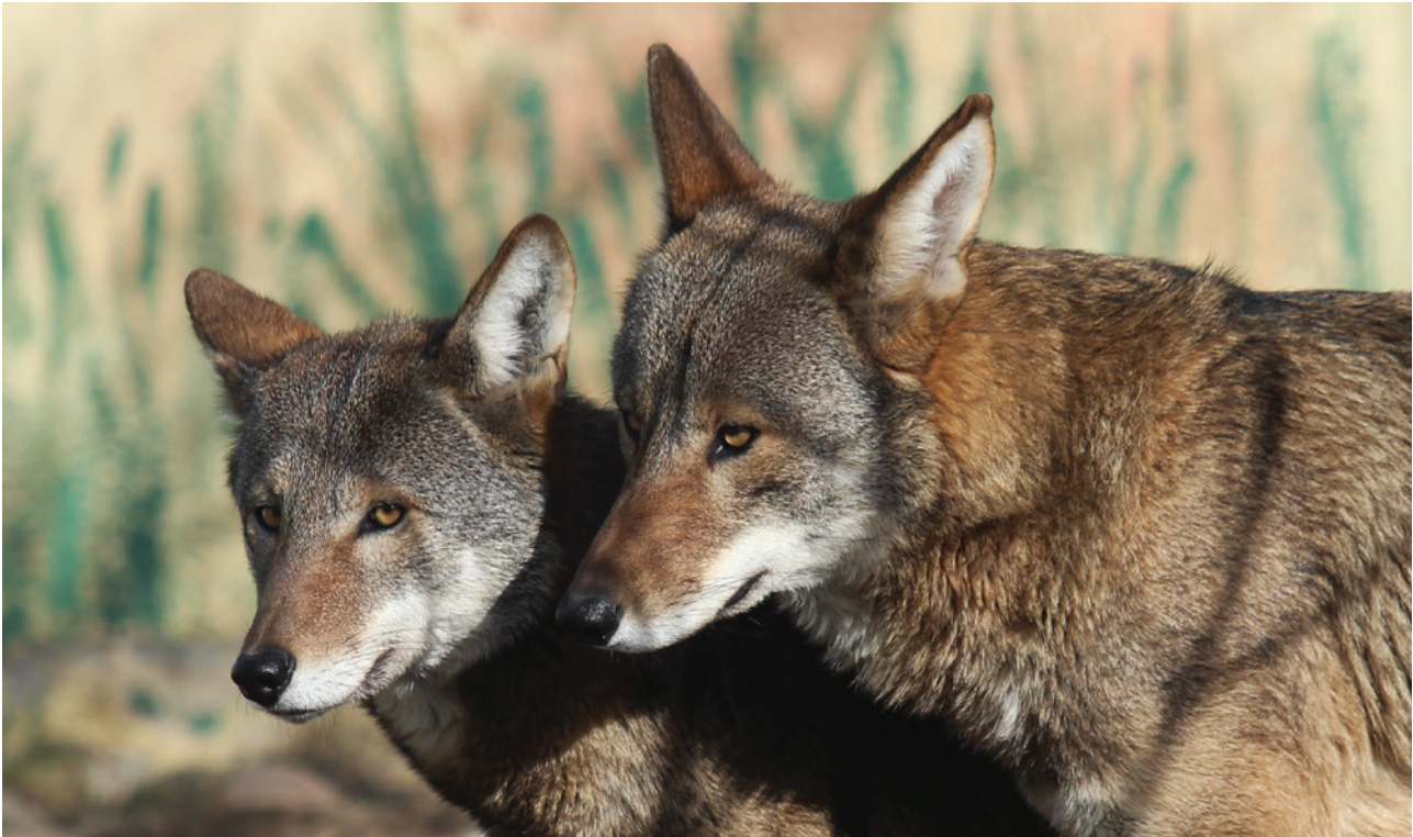
CHEYENNE AND WAYA , RED WOLVES